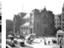
St Paul's Cathedral