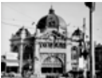
Elizabeth II crowned