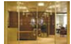
Firm moves to Queen Street