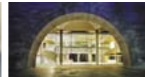
NGV moves to St Kilda Road