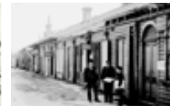
Flinders Street Station