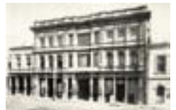
Law Institute of Victoria