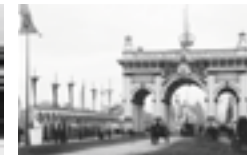
Corporation Arch, Princess Bridge